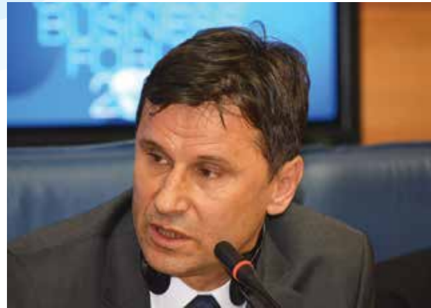
Fadil Novalic , Prime Minister of the Federation of Bosnia and Herzegovina