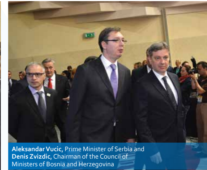
Aleksandar Vucic, Prime Minister of Serbia and Denis Zvizdic, Chairman of the Council of Ministers of Bosnia and Herzegovina