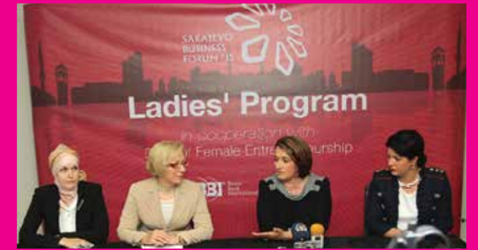
Conference focusing on development of business opportunities took place.

This year's program was organized in cooperation with Women Entrepreneurs Association "One". From 12 th till 16 th of May, International Fair of Women's Entrepreneurship and the International