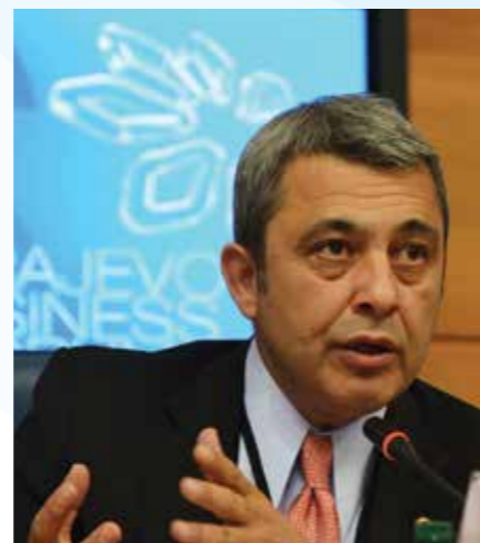
Wolfgang Fengler , Lead Economist in Trade and Competitiveness at The World Bank

"We are addressing you as the Chamber of Commerce and I can tell you that we highly appreciate this country and this region. We are all directed at each other and we should not think only strategically but we have to find the meaning in human values in our relationships. This slogan of the forum 'One Region, One Economy' is very important. The Balkan region, politically, economically and culturally unites different religions, nations and cultures and this is indeed great wealth. No country can make a progress on its own without cooperation with its neighbors". ■